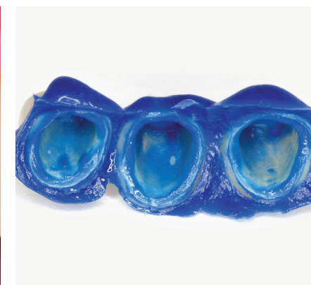
Check and adjust