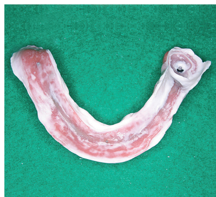
Apply and seat