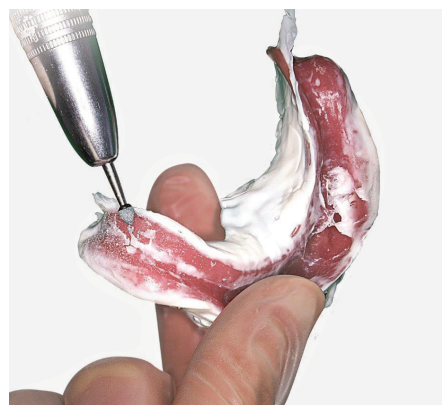
Check and adjust