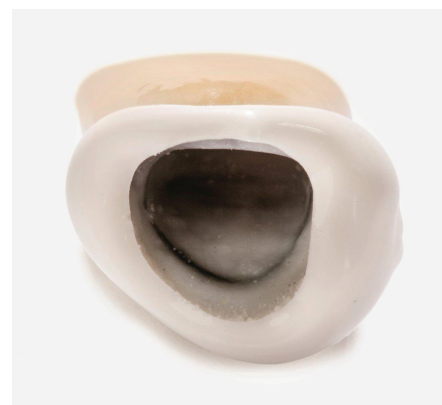
Ideal for metal crowns and bridges